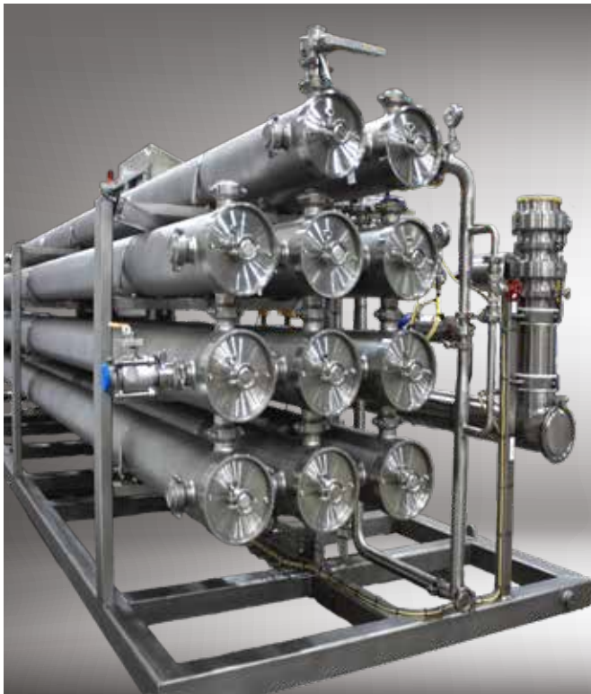
Low Maintenance & High-Recovery Aqua-Chem's Reverse Osmosis Systems

“Aqua-Chem Systems are long-lasting and reliable, featuring space-saving designs that seamlessly integrate with your existing equipment.”